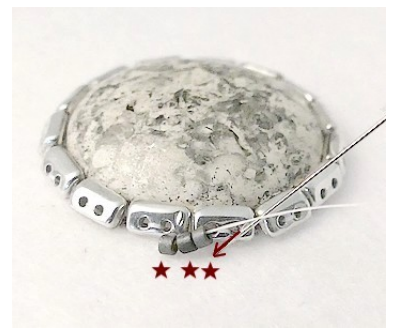
7) Pick up 3 DB