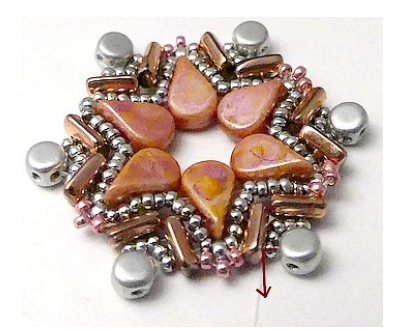
42) You'll now have this. Exit through R15