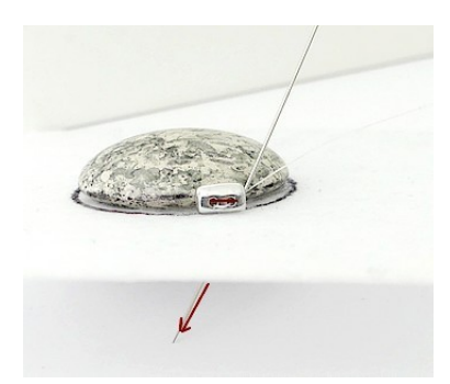
4) Exit through 2nd hole of Piros, pass your needle through the Lacy's