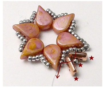
35) Pick up 1 Piros, 1 R15, 1 Piros, exit through R15 like picture. Repeat for the length of the pattern