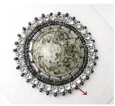
21) You'll now have this. Exit through R11