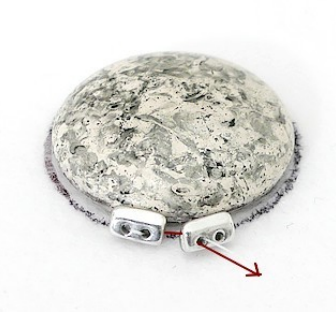
5) Raise your thread about 2 mm further and Pick up 1 Piros