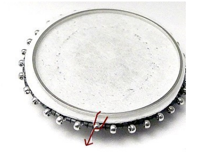
26) Turn work over, lay your circle on, pass your thread under the frame and through the R11