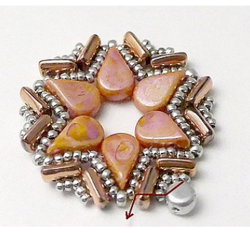
40) Pick up 1 Kalos, pass through R15 and Piros