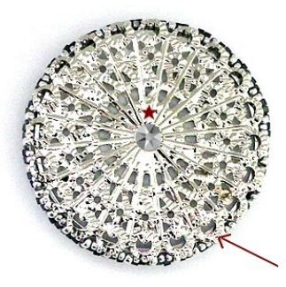
29) Another version if you don't want to bead the second face. Replace the circle by a filigree and zip like step 26. You can glue a flat back strass on the middle, add a bail and a chain of your choice !