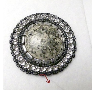
23) You'll now have this. Exit through 2 DB