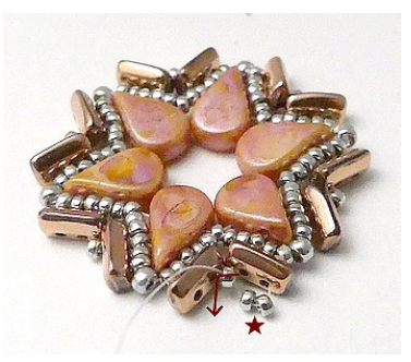
37) Pick up 2 R15, pass through R15 between the Piros