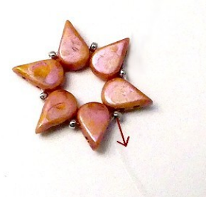
31) Pass through 1stAmos and exit throughR15