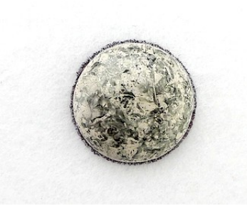
1) Glue the cabochon on the Lacy's – Draw a lign around the cabochon