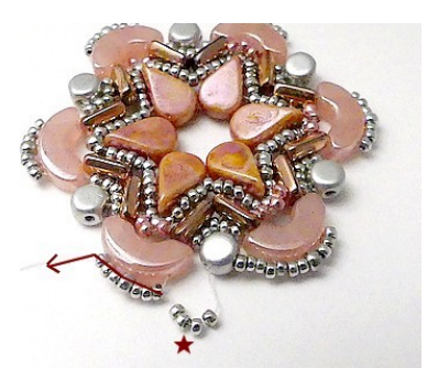
46) Pick up 4 R15, pass through all following seed beads. Repeat steps 45 and 46 for the length of the pattern