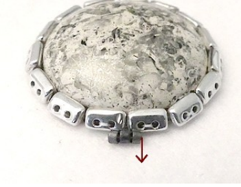
8) Pass through the Lacy's