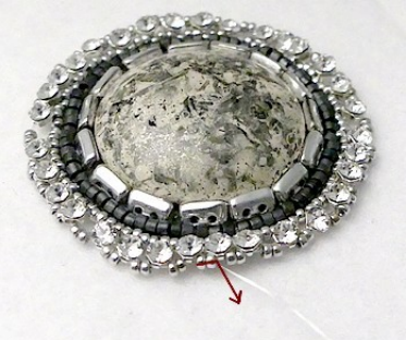
19) You'll now have this. Exit through 2 R15