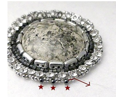
20) Pick up 1 R11 between 2 R15, repeat for the length of the pattern