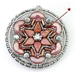
50) Glue a strass in the middle.