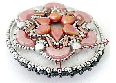
48) Pass through R11 on Face 1. Exit through all beads on Face 2 until the next R11. Repeat for the length of the pattern