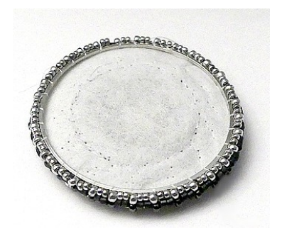
28) You'll now have this. Your work must fit the circle ! You can close your work