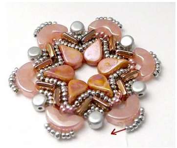
44) You'll now have this. Exit through 3 R15, 1 R11, 3 R15