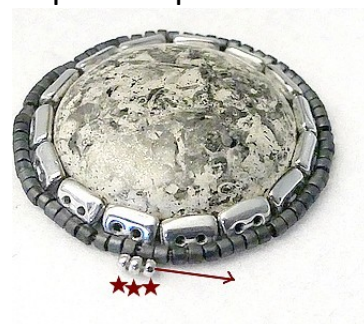
14) Pick up 3 R15 and repeat steps 8 to 11 like DB