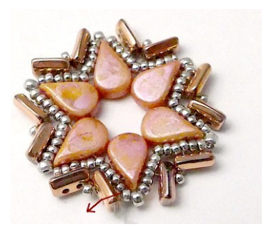
36) You'll now have this. Exit through Piros