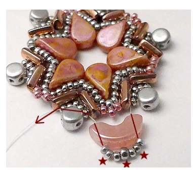
43) Pick up 1 Arcos, 3 R15, 1 R11, 3 R15, pass through 3rd hole of Arcos, R15, Kalos, R15. Repeat for the length of the pattern