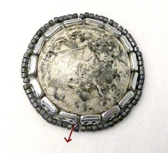
12) Repeat for the length of the pattern