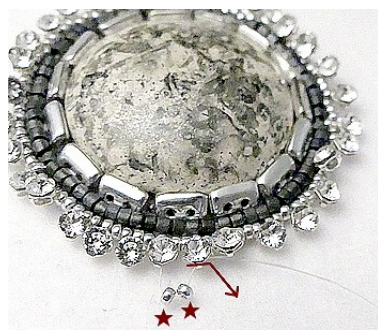
18) Pick up 2 R15 between each SM