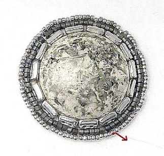
15) You'll now have this. Exit through 1 R15