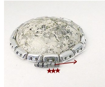
11) Pick up 3 DB etc... Repeat steps 8 to 11