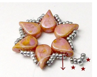
34) Pick up 2 R15, 1 R11, 2 R15 and exit through 1st R15