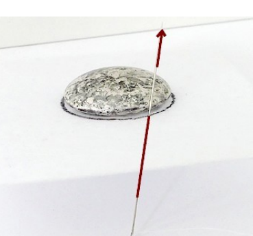
2) Place your thread with a knot under the Lacy's and exit through the drawn line