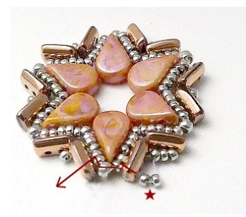
38) Pick up 2 R15, pass through Piros, R15, R11, R15, Piros. Repeat steps 37 and 38 for the length of the pattern