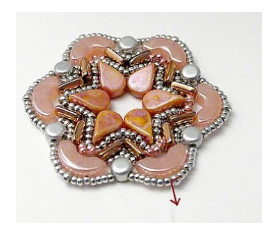
47) You'll now have this. Exit through R11 and lay your work on Face 1