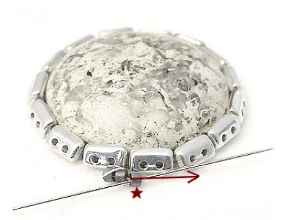
10) Pass through 3rd DB