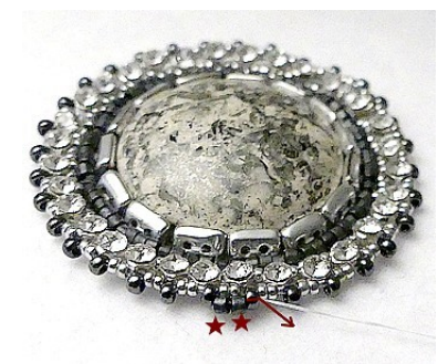
22) Pick up 2 DB11 between each R11