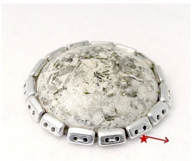
6) Repeat steps 4 to 5 for the length of the pattern, until you have used 15 Piros. Exit through Lacy's