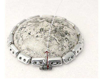
9) Come up between the 2nd and 3rd DB