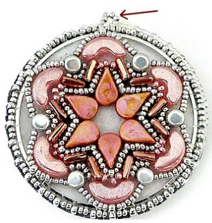
49) Bead a ring with 5 R15 for your bail. Repeat to strengthen and tie off