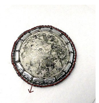
13) Pass through all DB again to strengthen