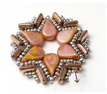
39) You'll now have this. Exit through R15