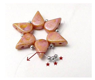
32) Pick up 3 R15, pass through 2nd hole of Amos. Repeat for the length of the pattern