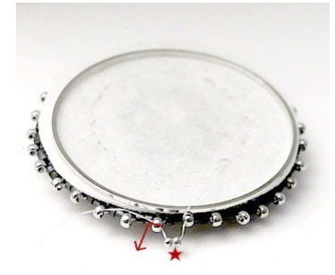
27) Pick up 2 R15, pass through following R11 and repeat steps 26 and 27 for the length of the pattern