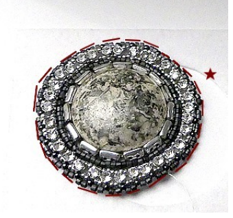
24) Cut the Lacy's, next to your work