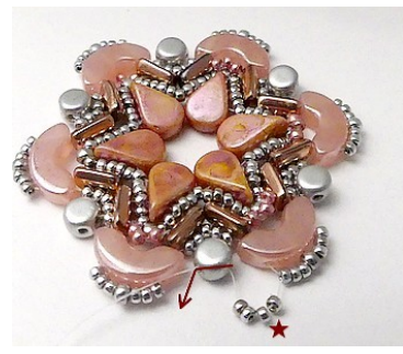
45) Pick up 4 R15, exit through 2nd hole of Kalos