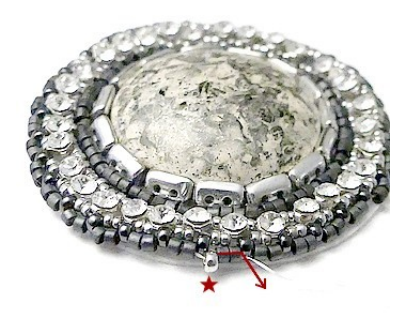
25) Pick up 1 R11 between each DB, repeat for the length of the pattern