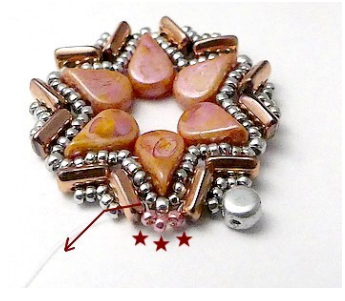
41) Pick up 3 R15 color2, pass through Pirosand R15. Repeat steps40 and 41 for the lengthof the pattern