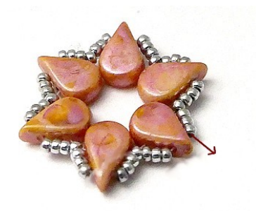
33) You'll now have this.Exit through R15